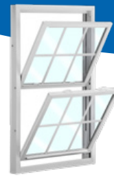
ULTIMATE SERIES 3201 DH