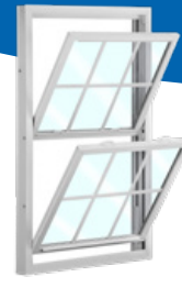
ULTIMATE SERIES 3201 DH